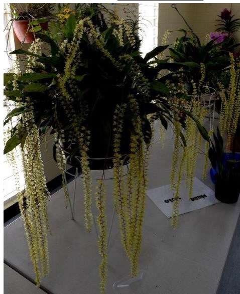
Specimen: Dendrochilum cobbianum W & J Nicholson