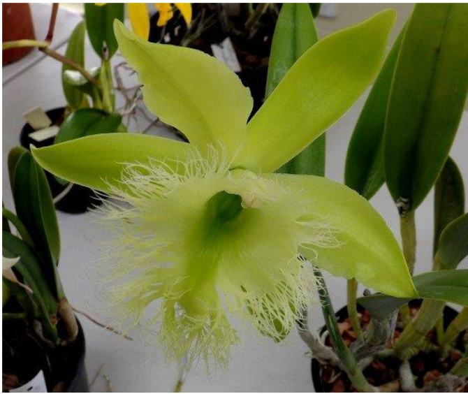
SPECIES:-Rhyncholaelia digbyana 'Mrs. Chase'