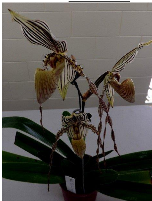
Hybrid : Paph Saint Swithin Bruno Figuera